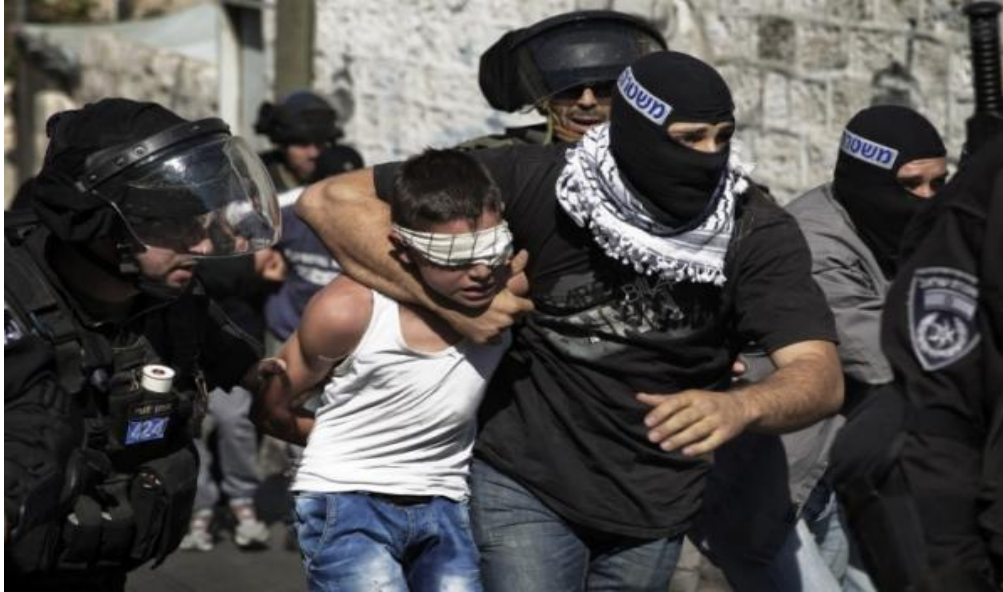
(Israeli Police Detain A Palestinian Child in Jerusalem:)