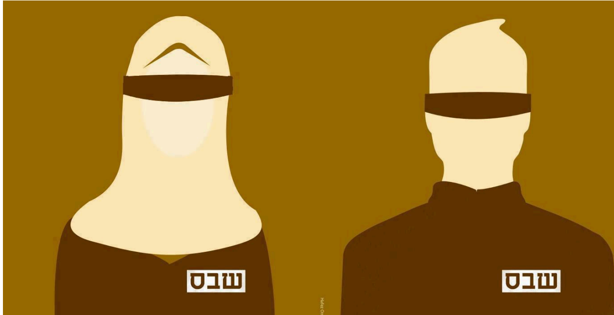
(Hunger Strike Image by Hafez Omar)