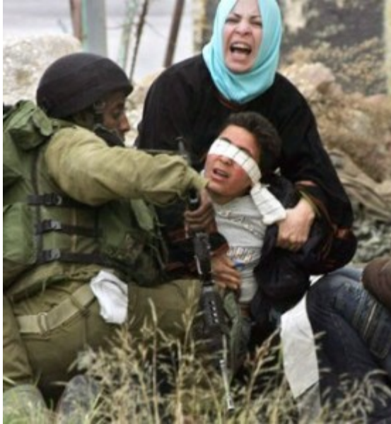
(Palestine's Children: Across the Spectrum)