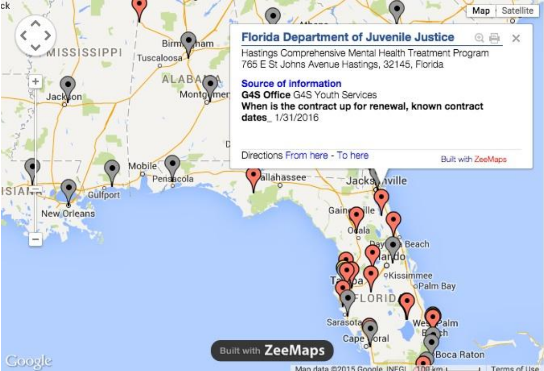
(G4S Located Florida Zoom-In: FOSNA 2015, fosna.org/g4s)