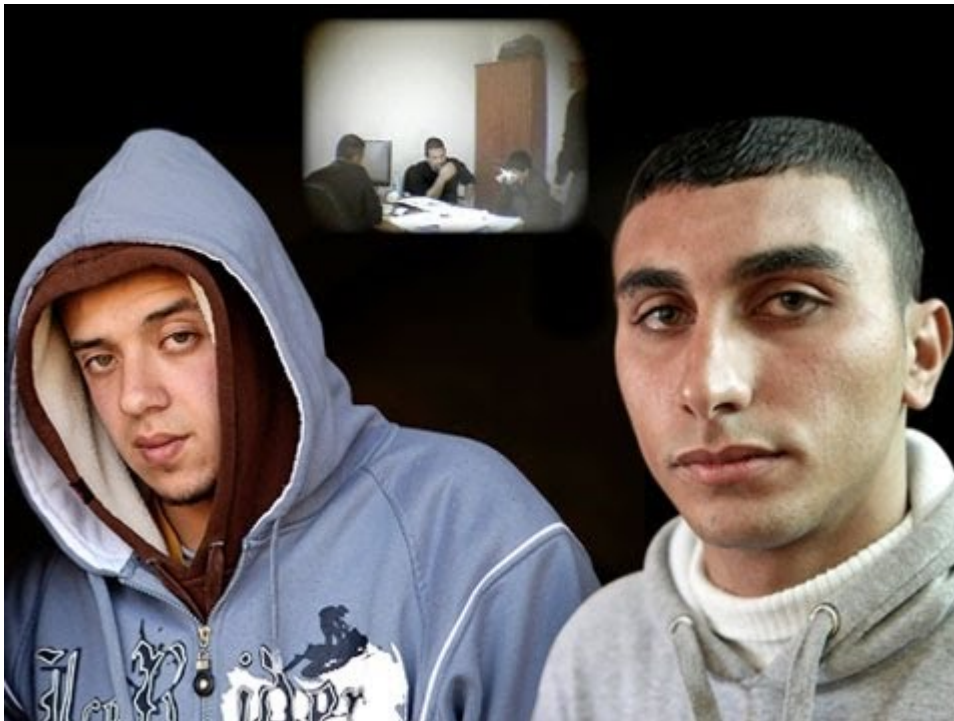
(The two boys speak with The Guardian on their experiences in Cell 36: The Guardian 2012)

"The cell is 2 m long by 1m wide, it's as big as a mattress, without the toilet. You put down the mattress and in front is the toilet... There is no window...the air chokes you."