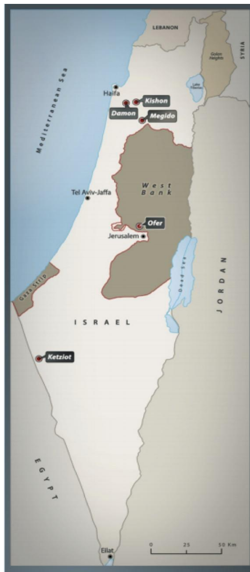
(Location of Israeli Prisons: Who Profits)