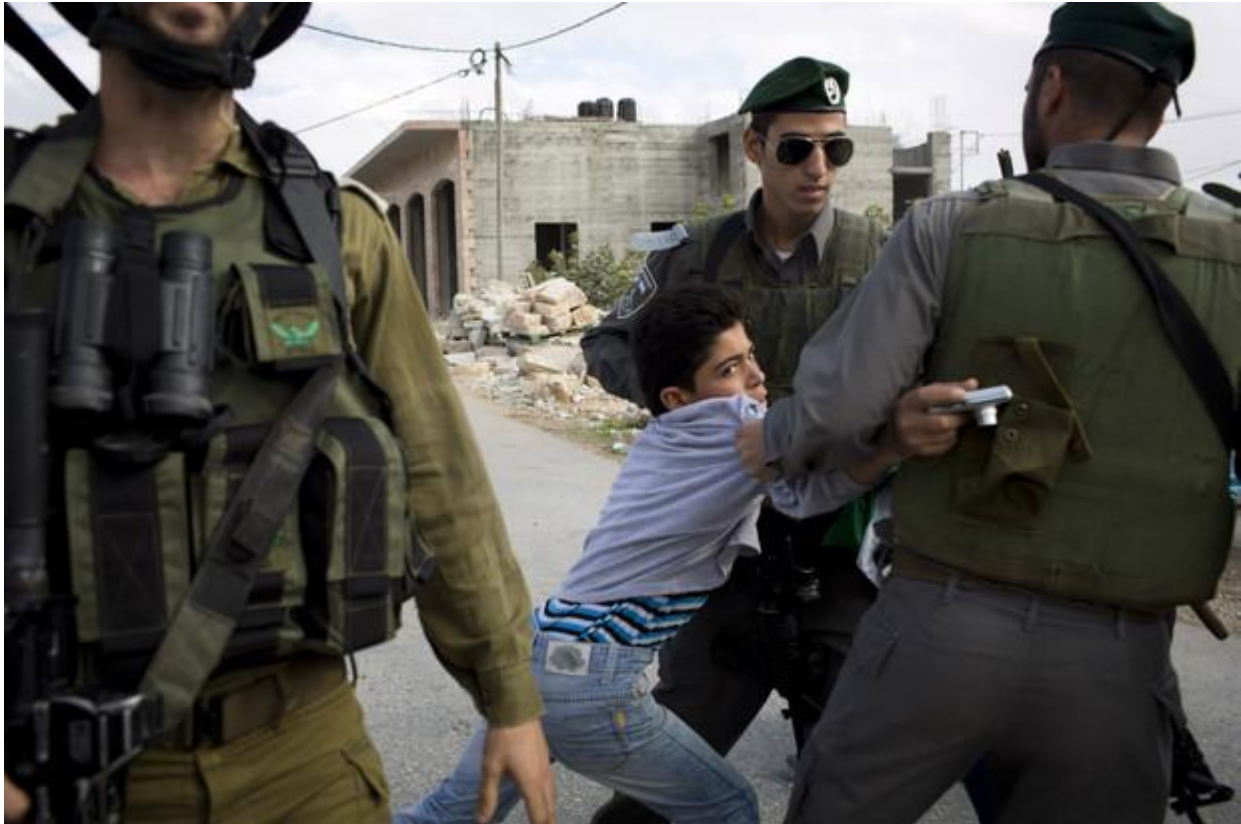
(Arrest of Palestinian boy in West Bank village of al-Maasara:)