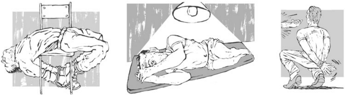
(Above: Different methods of torture 79 commonly used on Palestinian prisoners 80 , such as “The Banana Position” 81 on the far left: B’Tselem 82 , illustrations by Ishai Mishory)

“Someone is pounding on the door. It is 3:45 a.m. The pounding gets louder. The father goes to open the door, and immediately they enter: two men dressed in civilian clothes, flanked by police officers bearing heavy guns. They go straight towards the boy, who has pulled on a baggy sweatshirt and stepped out of his room, snake their hands under his arms, and take him. “He will only be gone for a