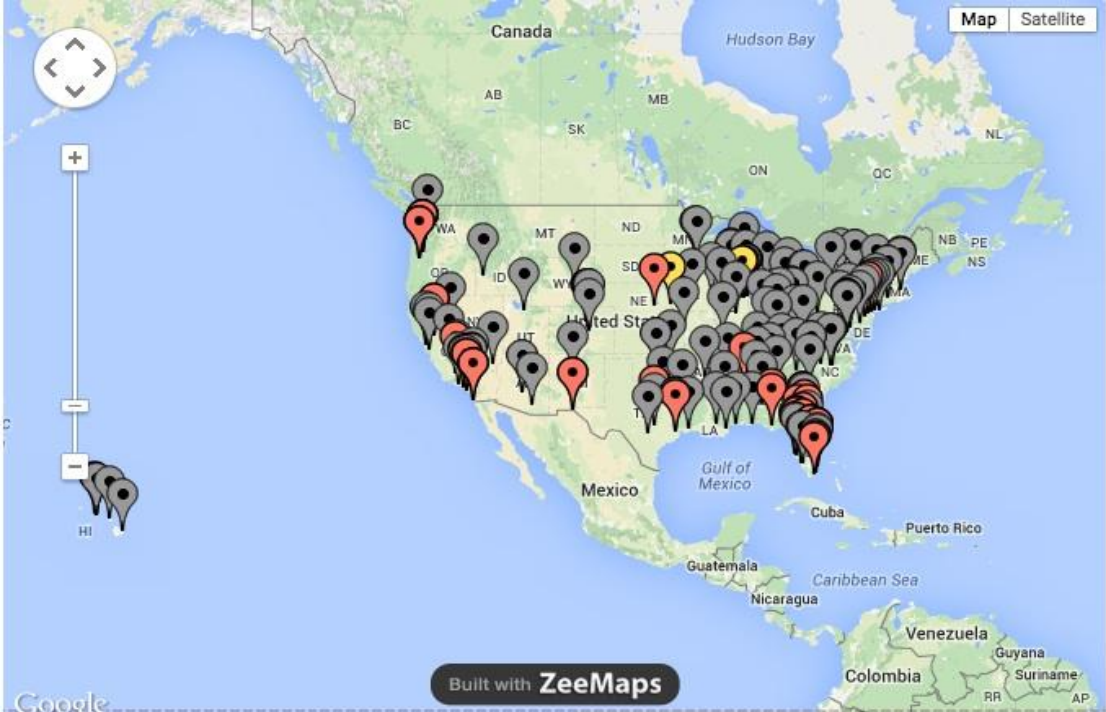
(G4S Located USA: FOSNA 2015, fosna.org/g4s)